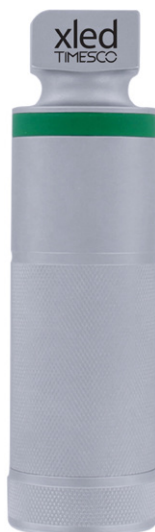
Stubby 2x AA