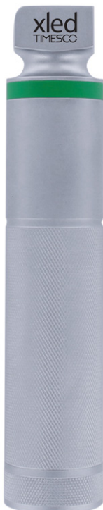
Medium 2x C