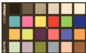
Colors at 3500 K (halogen lights)

With rail-mounted, and mobile versions available, SOLIS 30 is suitable for all work environments. To make practitioners' everyday tasks easier and avoid maintenance problems, the SOLIS 30 uses LEDs which have a considerably longer service life than halogen bulbs, leaving practitioners free to devote all their time to patients.